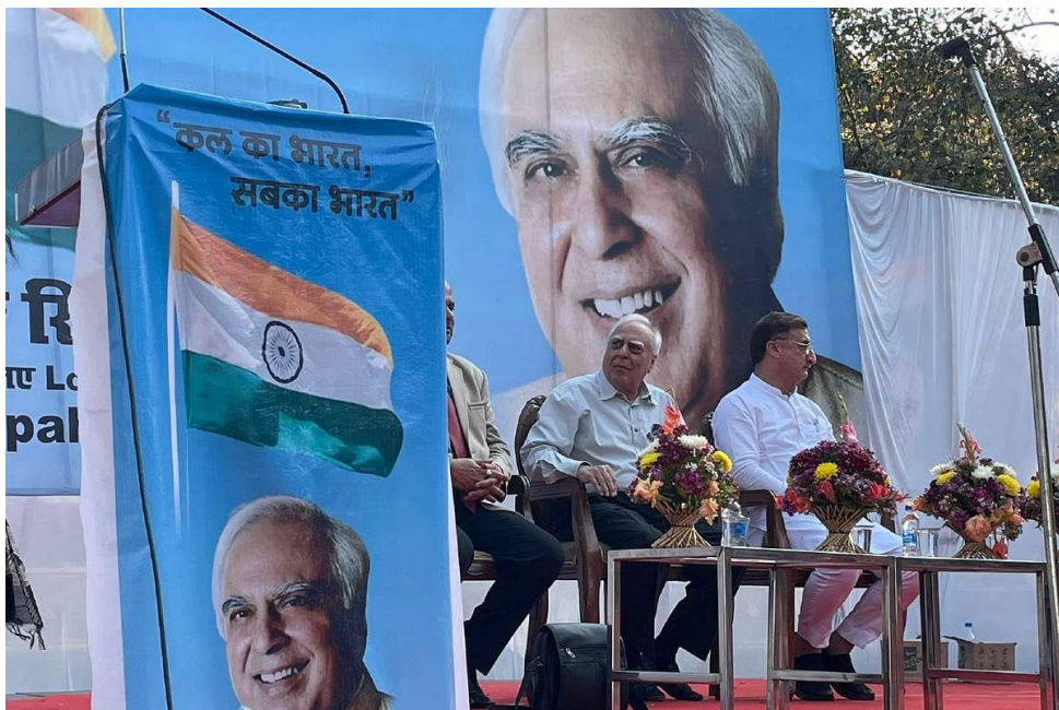
Kapil Sibal at Saturday's event

New Delhi: From exemption under section 80G of the Income Tax Act to industrialists who build schools for girls, to four constitutional courts of appeal in all regions — independent Rajya Sabha MP Kapil Sibal Saturday laid down six demands to be made to the government by his new citizens' collective called 'Insaaf'.