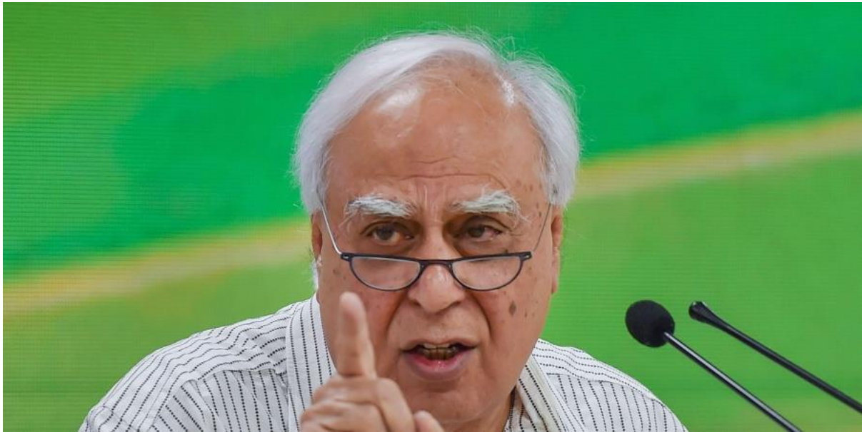
Rajya Sabha MP Kapil Sibal.